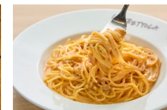
LA BETTOLA da Ochiai