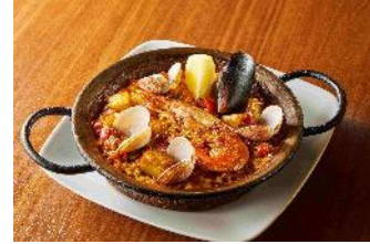
Spain Shokudou Ishii with Nomiya Buchi