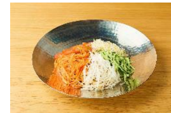
Shojin Cuisine DAIGO