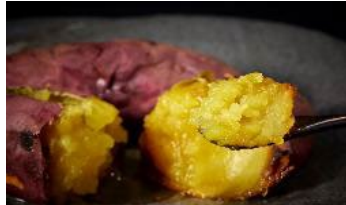
OIMOYA Farmers' Kitchen - Sweet Potato Sweets