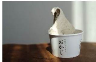
Japanese Gelato Okaji TOKYO