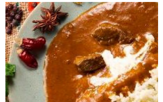
gibier kitchen jaeger