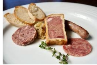
Auberge • espoir