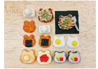
fake food art association