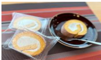
Niigata RiceFlour Sweets