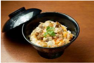
Nagoya Cochin Ichiou Ginza