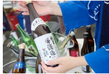
TOKYO SAKE & SPIRITS MARKET