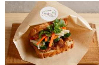
My Banhmi by GlutenFree TOKYO