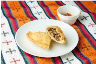
Tibetan Restaurant & Cafe Tashi Delek