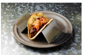
Blue Entrance Kitchen