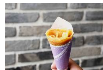
Pâtisserie Cacahouète Paris