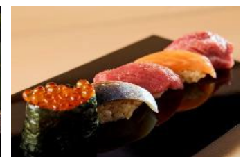
Hanare Sushi Tobi