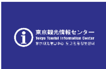
Tokyo Tourist Information Center