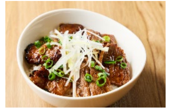
Amano Butcher shop kosyutenzan