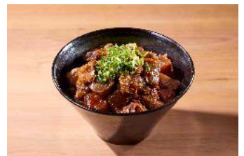
HAL YAMASHITA TOKYO