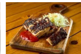
GOOD WOOD TERRACE