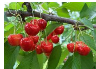
OHSYO FRUITS FARM