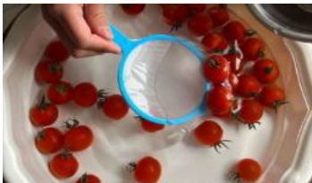
super tomato scoop